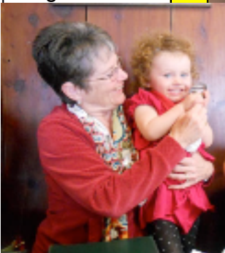
Mother's Day in HMB