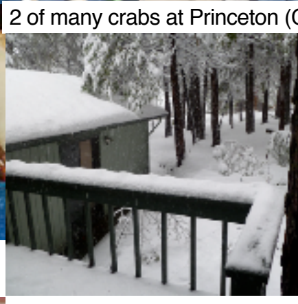
Last year's snow in Murphys.