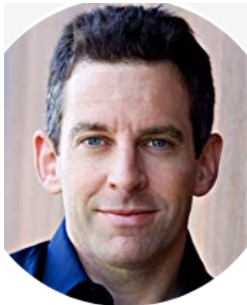
Sam Harris, Ph.D