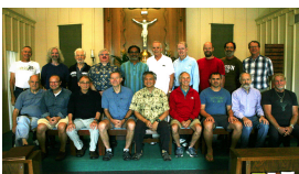
COJ Men's Retreat