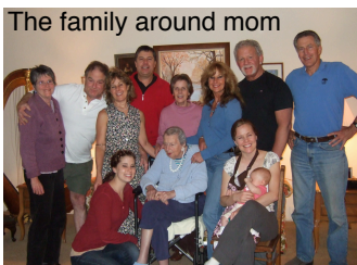
The family around mom

Curious about your guiding mantras. -Joe