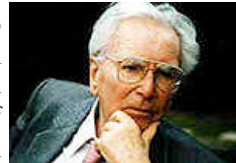
Victor Frankl 1905-1997

Some of you might have noticed that the phrase the “Freedom to Choose” is based on the quote and the philosophy of Victor Frankl and his famous book Man's Search for