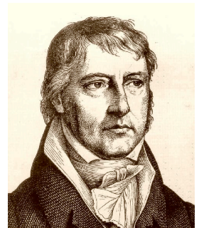
Georg Hegel 1770-1831

When the respect for this process breaks down (when one side has won too much over time, feels taken advantaged of, etc.) a state of conflict erupts, where winning,