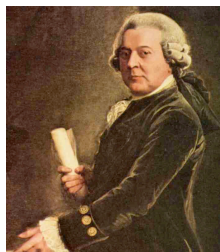
John Adams 1735-1826

Those truths are still with us today, and are in constant dynamic tension with each other: Individual rights vs. the common good, states vs. federal government, laissez faire (unrestricted) business vs. need for regulation, etc. When one side (thesis) dominates, abuses emerge, and then the pendulum must swing back to counter (antithesis) the imbalance--seeking the mean, the homeostasis,