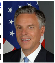
Jon Huntsman Jr.

Huntsman Jr. , who said his only allegiances were to the Constitution and his wife. Good