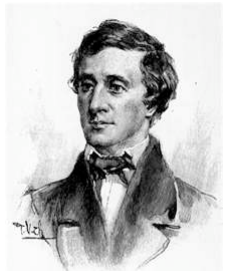
A younger Henry Thoreau

I would imagine so because each has its place in defining the length and breadth of any given problem by its extreme parameters.